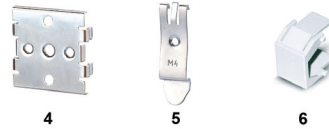
4-5 Adapter plates for DIN rail mounting 6 Blank cover