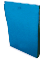
Suspension device LZ 1010