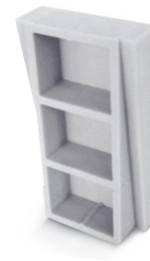
Suspension device LZ 1006