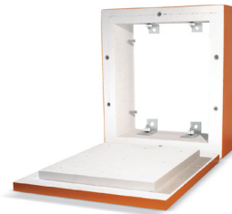
Hercules cover AHD E30-E90