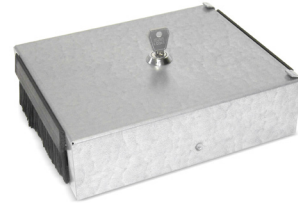
Consolidation Point box, 6 ports, with cover and lock (optional)