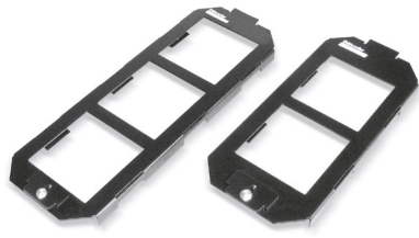
Floor box inserts for faceplates CSA Plus