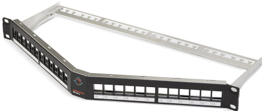
Shielded patch panel KS 24x-a, angled