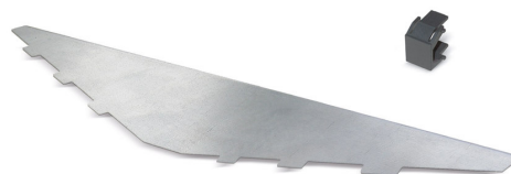
Top cover for patch panel KS 24x-a, angled Blank cover, black