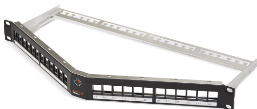
Shielded patch panel KS 24x-a, angled

for 24 modules with Keystone fitting shielded