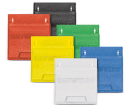
RJ45 module KS-T 1/8 tool-less Cat. 6/EA with dust shutter