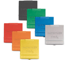
MS-K Plus 1/8 Cat. 6A RJ45 module, shielded, with dust shutter