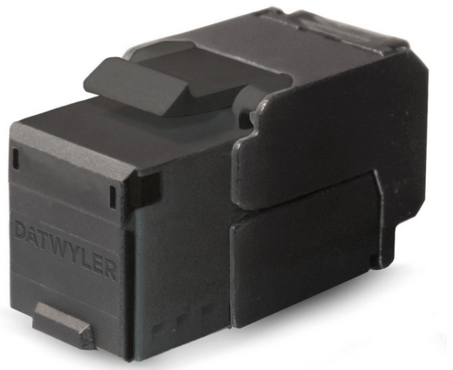
KU-TC Plus Cat.6A (IEC) RJ45 module, tool-less, unshielded, with dust shutter