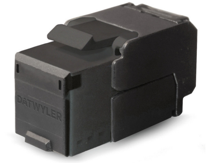
KU-TC Plus Cat.6A (IEC) RJ45 module, tool-less, unshielded, with dust shutter