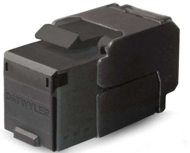
KU-TC Plus Cat.6A (IEC) RJ45 module, tool-less, unshielded, with dust shutter