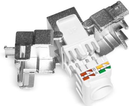
KS-T 5 1/8 tool-less RJ45 module, Cat.5e, shielded