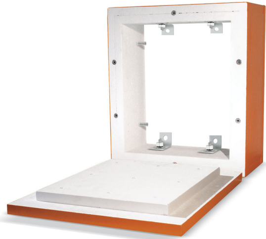
Hercules cover AHD E30-E90